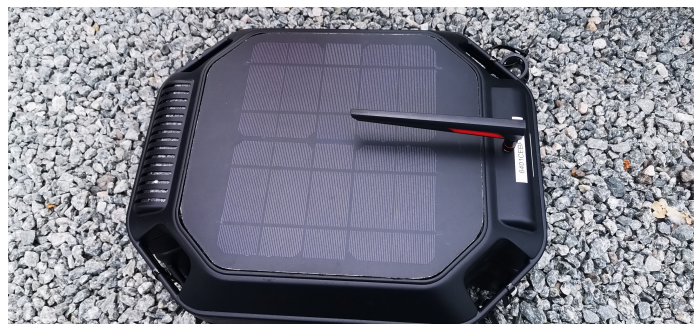
A WATR in-situ water quality monitoring unit

Fishery staff should be visiting waters to check dissolved oxygen (DO) levels regularly, throughout the day if possible. If this isn't feasible then aim to visit the water at dawn, when oxygen levels are at their lowest, so that you can act if needed. If it is difficult to visit the fishery on a regular basis you may want to consider an in-situ DO monitoring system. These record oxygen levels continuously and are really useful for alerting managers to DO issues. Some systems send the recordings directly to a phone or email and can even activate aeration should a trigger level be met