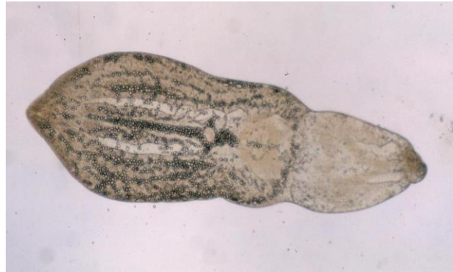
A blackspot parasite removed from its cyst

Blackspot is the name given to the cyst formed around the larval stage of the parasite Posthodiplostomum cuticola . This is a flatworm which has more than one host and a complicated life cycle. It is found in the skin, fins and gills of most freshwater fish. The black colour comes from a pigment, produced by the fish, in the tissue around the cyst. This pigmented cyst, which gives the parasite its common name, is clearly visible to the naked eye.