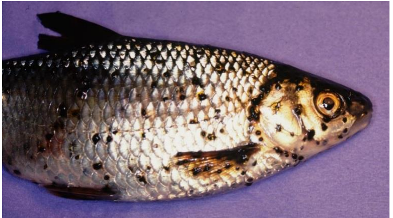
A fish with a heavy blackspot infection

Poor habitat may not only be bad for the fish, but for the aquatic snails that act as an intermediate host for the parasite. A low level of blackspot could be seen as a positive sign for a fishery. This is because it shows that there is substantial habitat for aquatic snails to survive, and they are an important part of the food chain in fisheries.